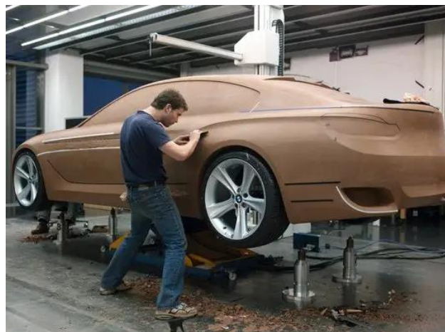
Figure 3. Creating a car body clay model [F3]

Study models or mock-ups serve the purpose of carrying out various tests and measurements on them. Figure 3 shows the creation of a car body clay model. It is apparently a detailed work, but with its help designers can collect a lot of important information about the 1 : 1 scale model of the dreamed form. The importance of the procedure developed by GM chief engineer Harley Earl is so much unquestionable as it is still used today. For example, on a 1 : 1 sized clay model of a car body we can make aerodynamical experiments in a wind tunnel. From this point of view, we are now talking about the clay model as a mock-up.