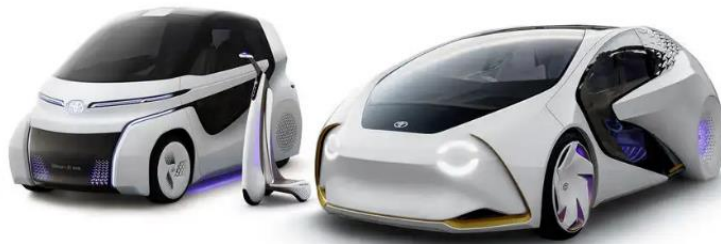
Figure 5. Toyota Concept-i series [F5]

Working models allow designers to examine certain parts of the design in action. In terms of cars, concept cars are of great importance. These are the models that are exhibited at various car showrooms, and those that can be taken for a test drive by interested possible customers, or which the main character of a movie races with on a cinema screen. These are the models with which car manufacturers can test the reactions of potential users or on which they can test certain experimental technologies. Figure 4 shows the Renault Morphose concept car. With the help of the QR code that can be seen in the figure a video introducing the concept can be watched. Figure 5 shows the Toyota Concept-i series concept.