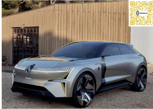
Figure 4. Renault Morphose [F4]