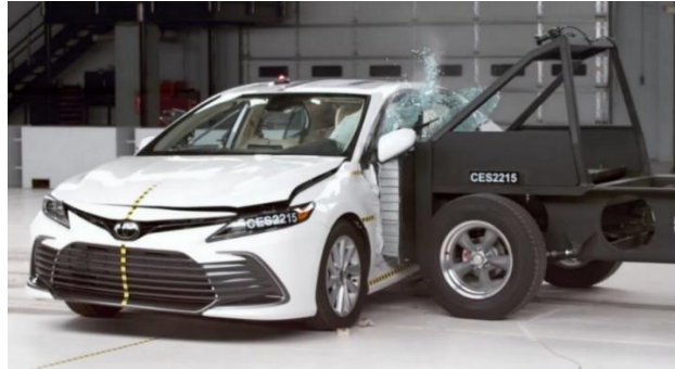
Figure 6. Side impact test [F6]