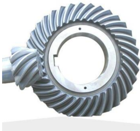
Figure 1. Gleason spiral bevel-gear pair [P1]

In the gear manufacturing industry, three large companies played a decisive role in the development of bevel gears. The three major companies, Gleason, Klingelnberg and Oerlikon laid the foundations for the production and theoretical background of modern bevel gears. Today, a significant portion of the bevel gears are manufactured using Gleason technology.