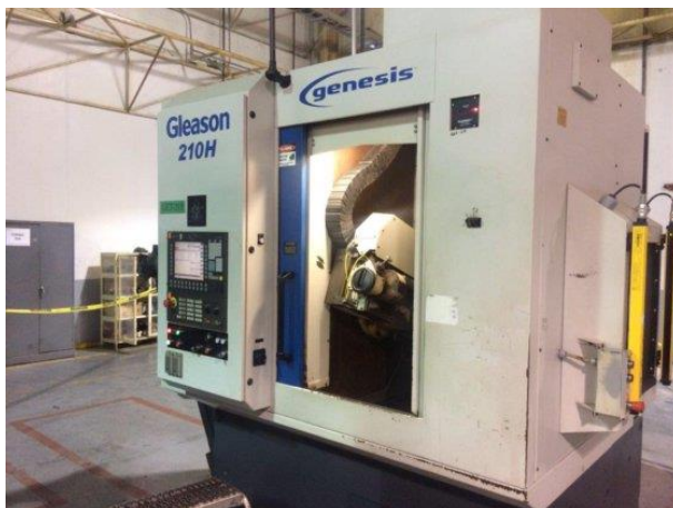
Figure 7. Gleason Genesis 210H (New Genesis series) [P7]

In 2006, the company introduced the ‘New Genesis’ family of milling and grinding machines. In 2011, in cooperation with Heller, 5-axis gear machining centres were established to produce large gears. In 2014, their ‘New Phoenix 280G’ machining machine will be released, which will significantly improve the tooth grinding performance of the bevel gear.