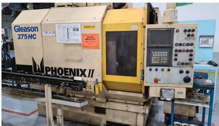
Figure 6. Phoenix II second gen. 6 axis Gleason bevel gear cutter [P6]

In 2000, the Phoenix II was introduced, which was already directly driven by a spindle drive it had higher productivity and faster grinding.