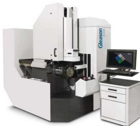
Figure 8. Gleason 500CB [P8]

In 2016, the 500CB analyser, and manufacturing equipment has been completed. The equipment is suitable for the manufacture and inspection of the machining heads.[5] [6]