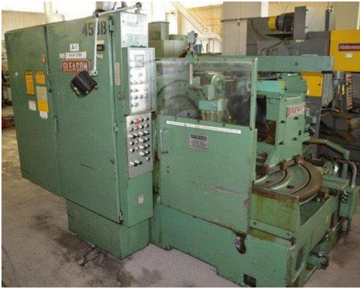
Figure 5. Gleason No. 641 Generator (PLC controlled) [P5]

In 1986, the company presented its first CNC-controlled bevel gear production equipment. In 1988, a production machine called Phoenix was created. It was the first 6-axis CNC-controlled milling machine suitable for the manufacture of spiral bevel gears [7], [8].