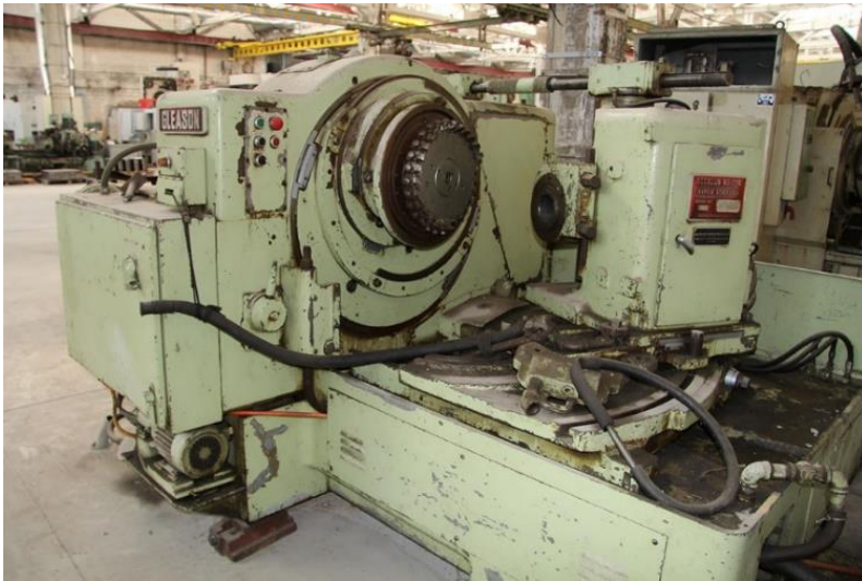
Figure 4. Gleason No. 116 Hypoid Generator [P4]

In 1977, Gleason introduced its PLC-controlled production equipment called the Gleason No. 641 Generator, which was able to create gears in a single workflow.