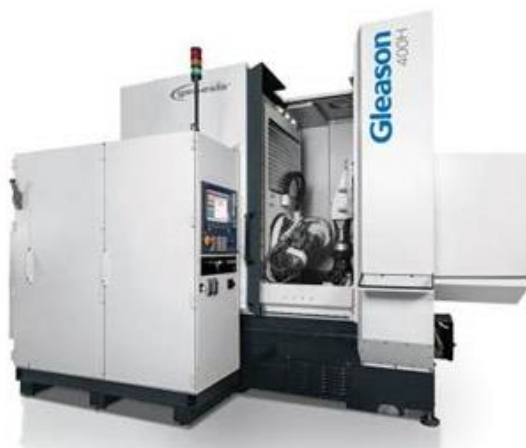
Figure 9. Gleason 400HCD [P9]

In 2018, Gleason began integrating KiSSsys design and FEM software with GEMS design and manufacturing software. This allows immediate action and communication between the design and manufacturing sides.