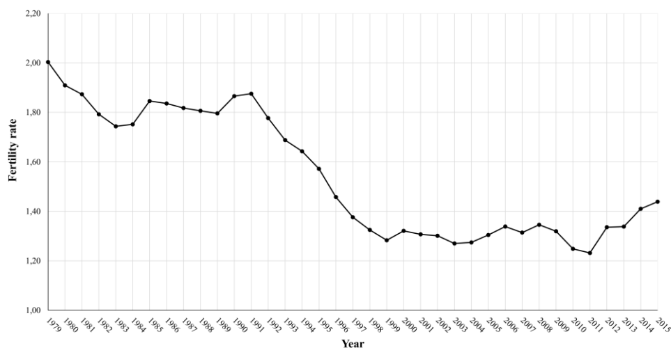
Chart 1. Fertility rate in Hungary, 1975–2015

In Hungary, this process was delayed slightly, due to social policies of the 1950's: In the first half of the fifties, and as these generations established families, in the seventies, birth rates have been extraordinarily high, but they, together with fertility rates, have been on the decline from the end of that decade. The birth figure of 1979 of 160 thousand dropped to 100 thousand by the mid-nineties, accompanied by a drop of the fertility rate from 2.0 to 1.3.