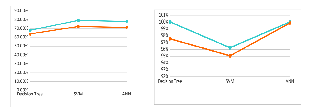
Figure 3. Graph Visualization of Comparison of Precision

Table 6 focuses on the comparison of both the tools using the F1-score. By looking at the table, it can be considered as RapidMiner is a good approach for F1-score for the smaller dataset and approximately equal score for the larger dataset.