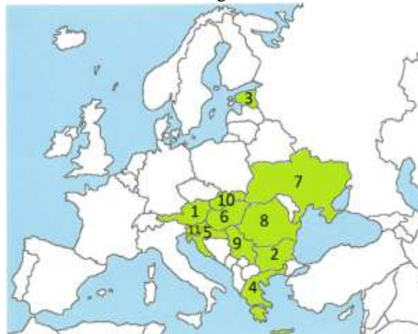
Figure 1. Selected countries [11]

On the map, green colour indicates the targeted countries.